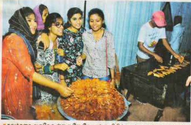
நவக்கரை அருகே உள்ள ஏ.ஜே.கே., கல்லூரியில் நடந்த கடற்கரை உணவுத் திருவிழாவில், அனைவரையும் கவர்ந்த மீன் வறுவல்.

கோவை, மாச்-22-கோவை அறிவியல் கல்லூரியில் உணவு திருவிழா வருகிற 24-ந் தேதி நடைபெறுகிறது. கல்லூரியின் உணவளிப்பு அறிவியல் மற்றும் உணவக மேலாண்மை துறை சார்பில் கடற்கரை என்ற தலைப்பில் 10-வது உணவு திருவிழா நடைபெற உள்ளது. இதில் சைவ, அசைவ உணவு வகைகள் இடம்பெறுகின்றன. கடல் மீன்களின் ருசியை பொதுமக்கள் கவையத்து மகிழலாம். சைவ பிரியர்களுக்கு உடுப்பி தற்காரி பிரியானி, காளைச் சின்ன வெங்காய தியல், தேய்க்காய் பால் காய்கறி கலவை குருமா, பால்பயம், மலபார் புரோட்டா, பல்வேறு