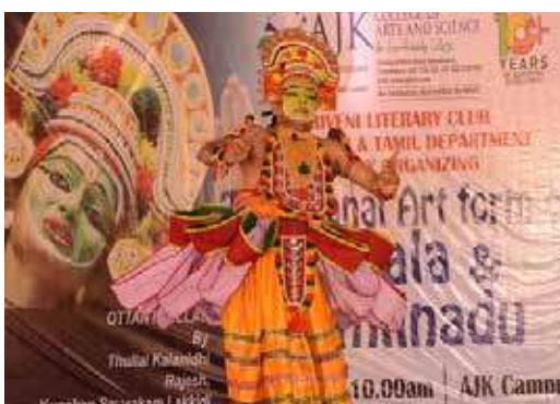
Traditional Art forms of Kerala & Tamil Nadu organized by the Department of Language on March 4, 2019