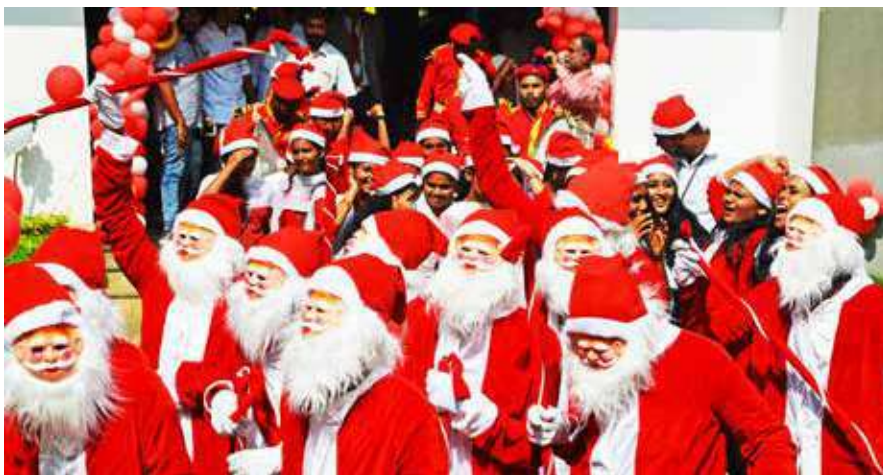
Christmas 2018 celebrated by our students.