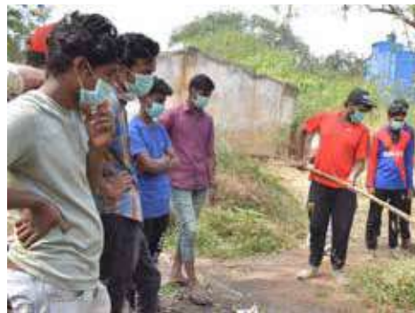
The NSS volunteers visited Chinnampathy village to clean the area to dig pits for planting trees in the village