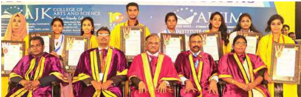
The rank holder with Chief Guest at the 8th Graduation day