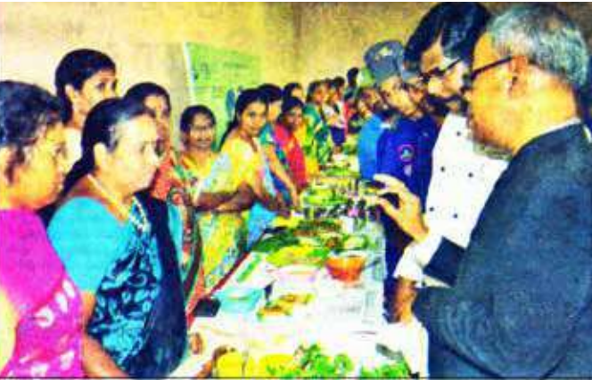
இட்லி தயாரிக்கும் போட்டியில் பங்கேற்றவர்களை பதத்தில் காணலாம். ஏ.ஜே.கே. கலை அறிவியல் கல்லூரி சார்பில்

இட்லி தினத்தை முன்னிட்டு கோவை ஏ.ஜே.கே., கல்லூரி சார்பில் நடந்த விழாவில், விதவிதமான இட்லி வகைகளை காட்சிப்படுத்தினர். மாண்புமிகு உணவு அறிவு அமைச்சர் தலைமையில் இட்லி தினம் கொண்டாட்டம் நடைபெற்றது. இட்லி தினம் கொண்டாட்டம் நடைபெற்றது. இட்லி தினம் கொண்டாட்டம் நடைபெற்றது.