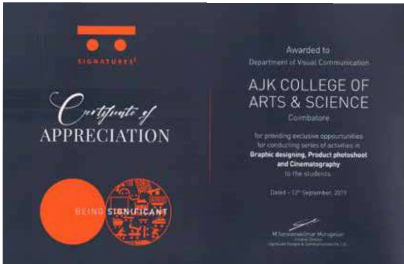
Certificate of Appreciation received from signatures for Graphic Designing, Product Photoshoot and Cinematography on 12th September 2019