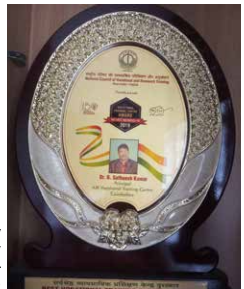
Best Vocational Training Centre Award received from National Council of Vocational and Research Training in the year 2019