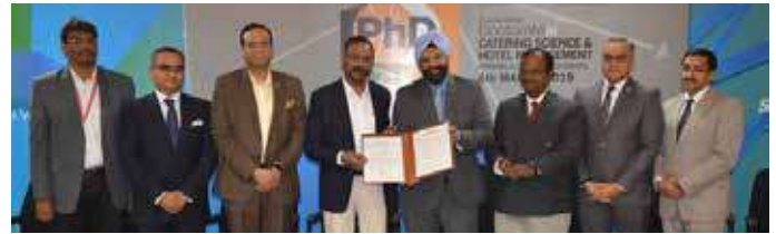
Launching Doctorate in Catering Science and Hotel Management held on March 6, 2019.

A public event on celebrating World Idly Day was conducted on March 30, 2019. The participants were from various parts of Coimbatore. The participants displayed a variety of idlies in the competition.