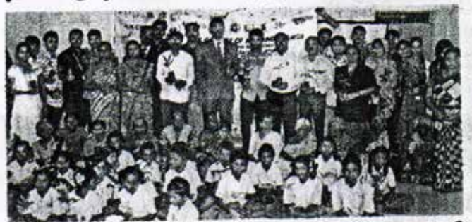
ஏ.ஜே.கே கலை அறிவியல் கல்லூரி சார்பில் புதுப்பதியில் நடந்த நாட்டு நலப்பணித்திட்ட முகாமின் போது மரக்கன்றுகள் வழங்கப்பட்டன.