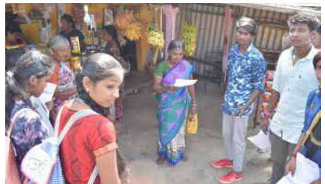
Distributing the pamphlets to create awareness on Hygiene on public