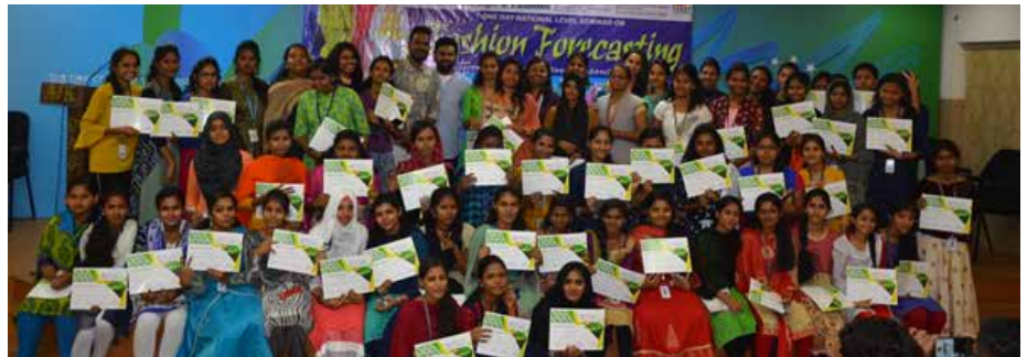
Students from other institutions with the Participation Certificates of National Level Seminar on Forecasting Fashion Trends held on March 9, 2019

tie & dye. It enabled them to use it in explore their talent in designing costume.