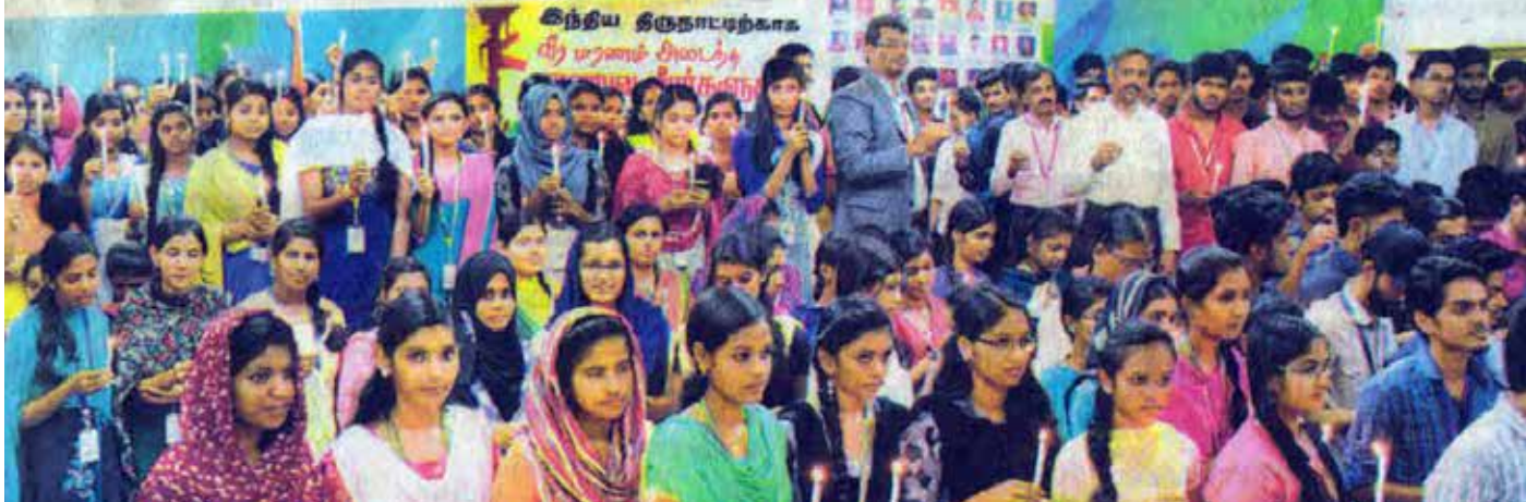
A tribute to the CRPF brave hearts martyred in the Pulwama attack