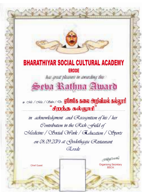
International Award The Best College Award -2019 Tamil Educational Site For Indian Students Malaysia & Kaviyarasar Kalai Tamil Sangam, Namakkal