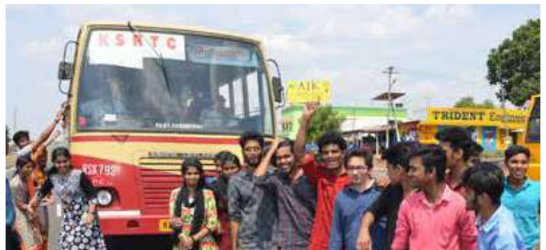
KSRTC obliges the colleges by allowing a bus stop facility for college students and public at navakkarai