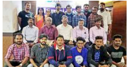
Alumni Meet conducted in Chennai Chapter on 29-09-2018