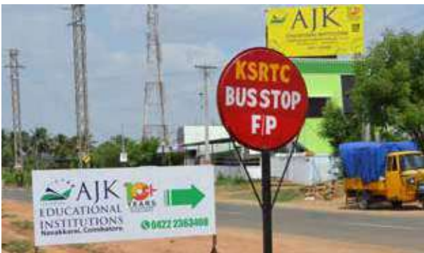
Requested bus stop facility provided for students and the public on 8 th July 2018.