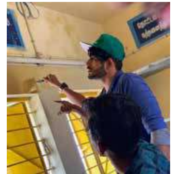
NSS volunteers White Washing Mavuthampathy village library & Renovating it.