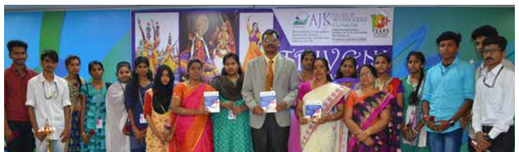
Inauguration of Triveni Association by Language department held on September 19, 2018.

Inauguration of language association was conducted on 19.09.2018. It was titled “TRIVENI”. Students Learnt about importance of language and how it acted as human identity. The program was informative and entertaining.