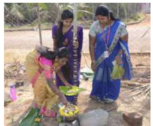
Our students celebrated the Pongal Day on 10 th Jan 2019. Various competitions were conducted.