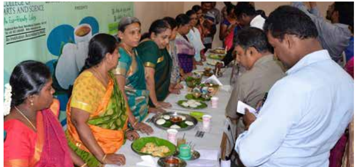
Visitors witnessing the Idly Day Celebration