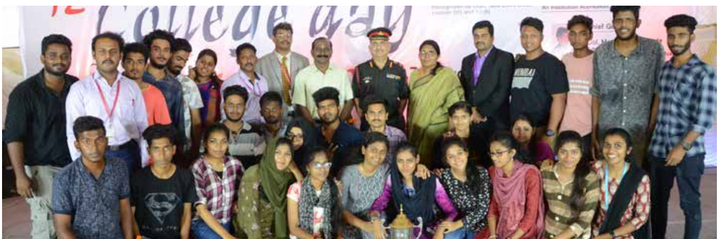
Department of Computer Applications wins overall Sports Championship Trophy of the year 2018-19