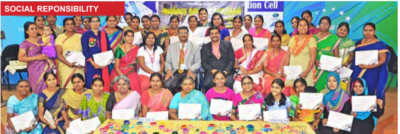
Women Empowerment Cell, NSS and Department of Costume Design and Fashion conducted a two- day workshop for Self Help Group women in Jewellery Making on 19 th and 20 th December 2018. The participants received Jewellery and Participation Certificates