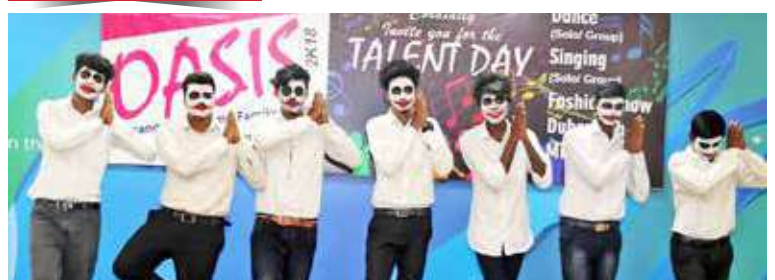
Our Hostel Students celebrated talent day on 23 rd Oct 2018. All the students participated and displayed their talents.