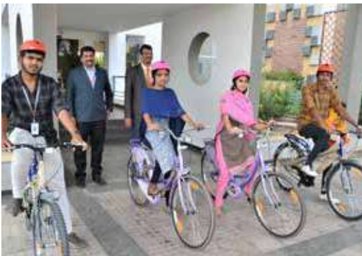
Students utilising Bi-cycle inside the campus to maintain pollution free campus.