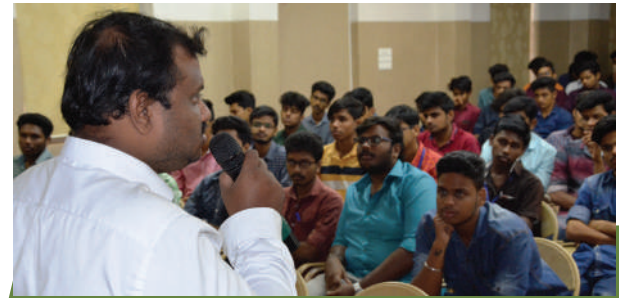
A One day Seminar on Bigdata Analysis with Digital Marketing was conducted on Feb 01, 2018.