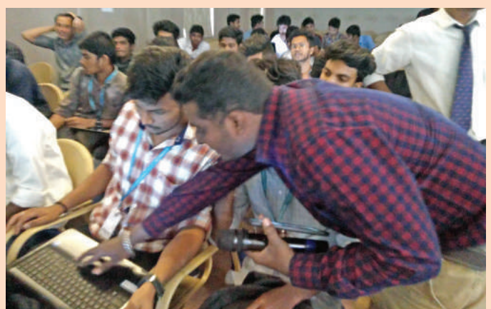
National level college workshop-Selenium and Automation Testing -SELEST conducted on Feb 23, 2018.