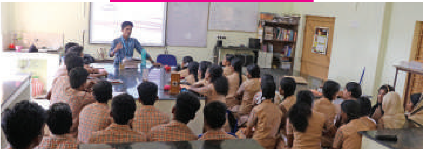
An Awareness programme on higher education was organised for +2 students of BGHSS, Palakkad.