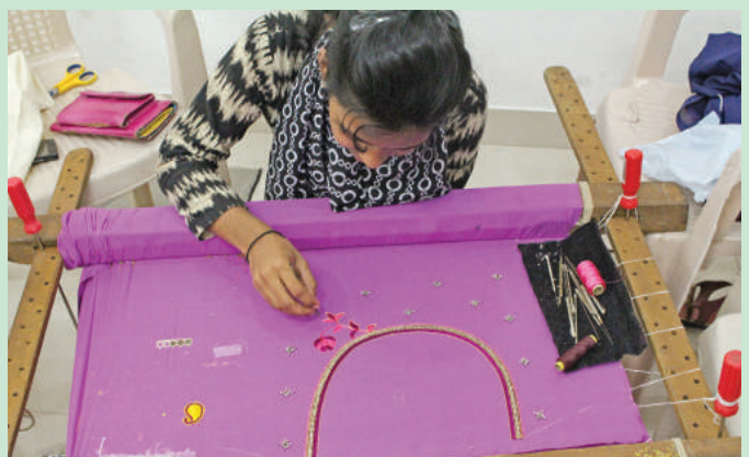
A 3-day workshop on "Maggam Embroidery Techniques" was conducted.