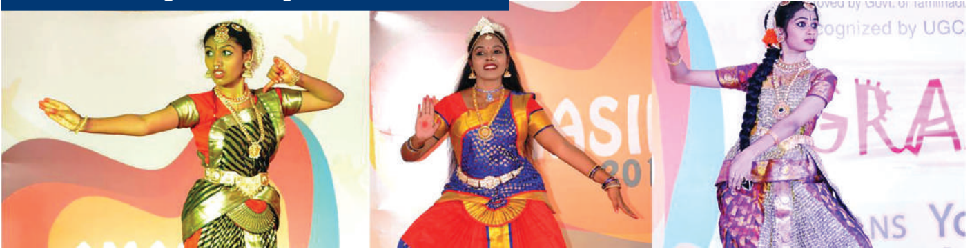
Our Students performing in Inter Collegiate Competition- AMASIKO held on Feb 22, 2018.