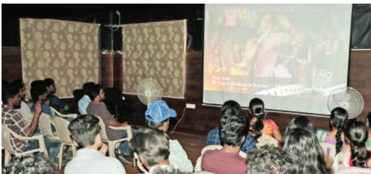
Students viewing the KINO fest promo at the Coliseum theatre (Viscom lab) which was specially made by the students.