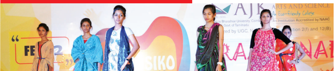
Our Students Participated in the Fashion Show in Inter Collegiate Competition- AMASIKO held on Feb 22, 2018.