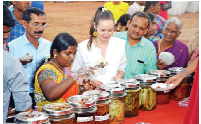
International visitors tasting food at "Kara Sara Pandiyanattu Samayal 2018"