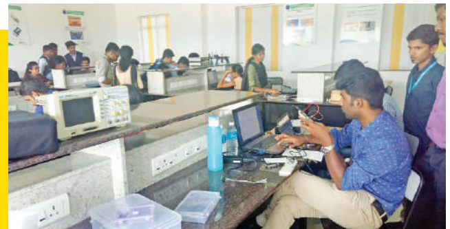
A 2 -Day State-Level Workshop on IoT using ESP8266 Based on LUA and Micropython was conducted on Oct 9 and 10, 2017.