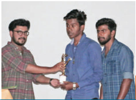
Chief guest hands over Cash Prize of Rs.7000/- and a trophy to the Best Short film KATTUKADHAI which has won the 1st place in the Film Fest.

A National-level Short Film Fest Competition – Kino was conducted on Feb 23, 2018.