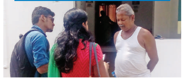
B.CA. Students interacting with the public to create awareness on Socio Economic Environment Survey conducted on Jan 4, 2018