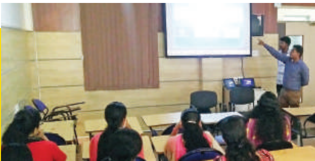
Resource person Delivering a Guest Lecture on Android Mobile Application Development using IBEACON on Sept 14, 2017.

A one- day Seminar on Vehicle System of Systems in the IoT was conducted on Jan 29, 2018. The IoT is the network of physical devices, vehicles and other items embedded with electronics, software, sensors, actuators and network connectivity which enables the objects to collect and exchange the data.