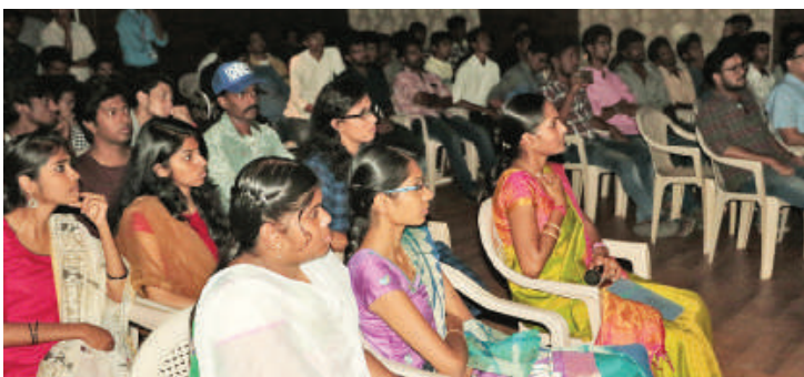
Screening & Workshop session of short films at the Viscom lab