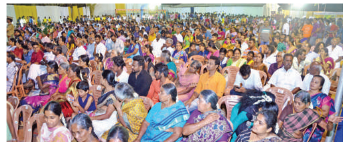
A cross- section of visitors at the "Kara Sara Pandiyanattu Samayal 2018"