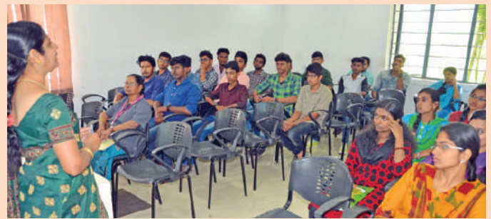
Guest Lecture on Financial Avenues For Budding Managers