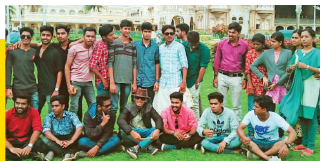
The students were taken on an Industrial visit to Mysore