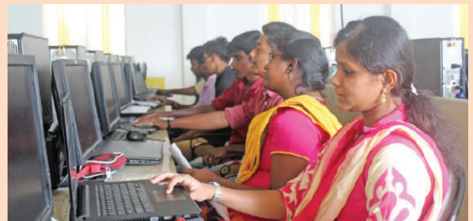
National level workshop on Selenium and Automation Testing -SELEST