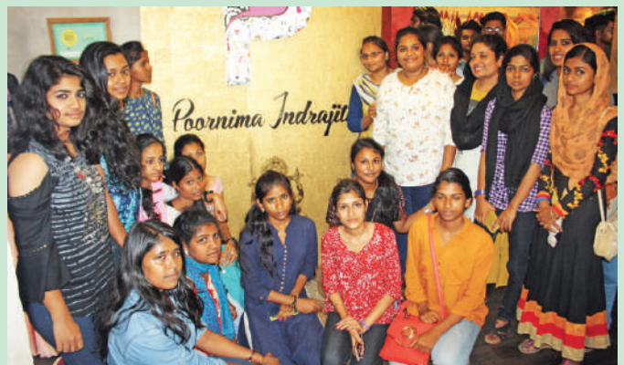
Industrial visit : students had a chance to see and collect details about the collection in Pranaah Boutique, Kochi.

On Feb 3,2018, our students went on Industrial Visits to the designer companies like Soucika Boutique and Joanns Designs where the students came to know about the latest designs in the fashion world.