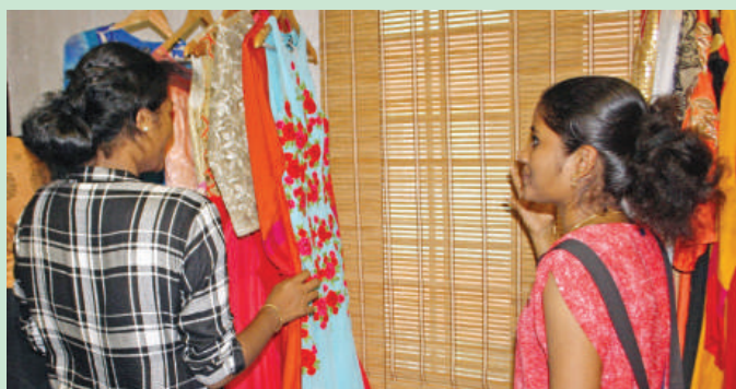
Industrial visit: students looking at the designs in Soucika Boutique LLC, Kochi.