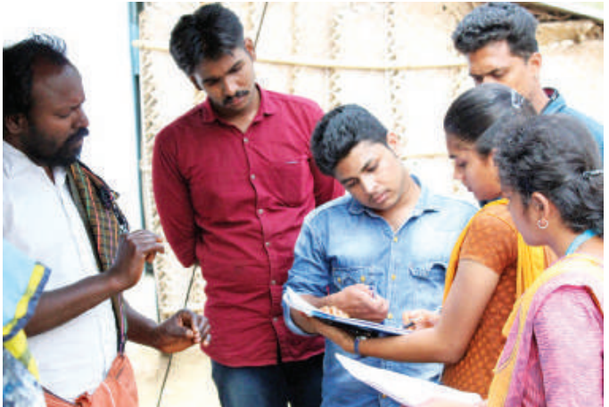
NSS Volunteers interacting with the Villagers during the Socio economic Survey.

ச.க.எஸ். தனி அலுவலர் / வட்டார வளர்ச்சி அலுவலர் (கி.எஸ்), மதுக்கரை நடவடிக்கை :- 1) வளர்ச்சி உதவி இயக்குனர் (வளர்ச்சி), கோயம்புத்தூர் அவர்களுக்கு பணிக்கப்படுகிறது. 2) தனி அலுவலர், இச்சூழல் வளர்ச்சி மதுக்கரை வட்டாரம், கோயம்புத்தூர், மதுக்கரை வட்டாரம் 3) மண்டல துணை வட்டார வளர்ச்சி அலுவலர் (கி.எஸ்), கோயம்புத்தூர், மதுக்கரை வட்டாரம் 16517 30 OCT 2017 ANJALAI COMBATORE - 641001