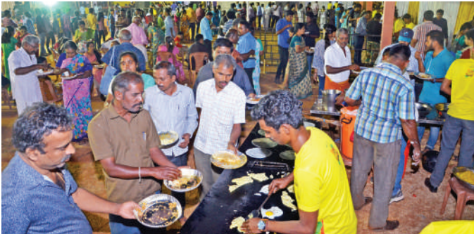
There were even foreign guests witnessing the "Kara Sara Pandiyanattu Samayal 2018"