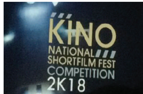
Screening of Kino fest Visual promo in the event.