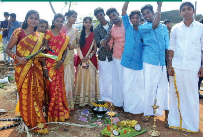
AJK Students Celebrating PONGAL on Jan 11, 2018. Wearing the Traditional Dress