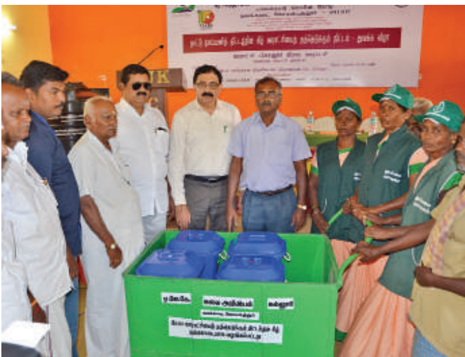
AJK College providing the water tank and dustbin with trolley to Pichanur panchayat on Nov 15, 2017.