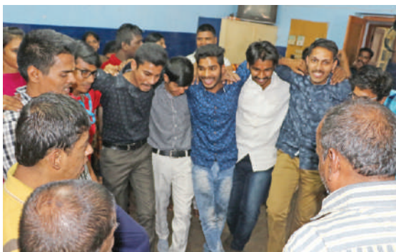
MSW students performing cultural programmes for the inmates of Karunai Illam on Feb 6, 2018