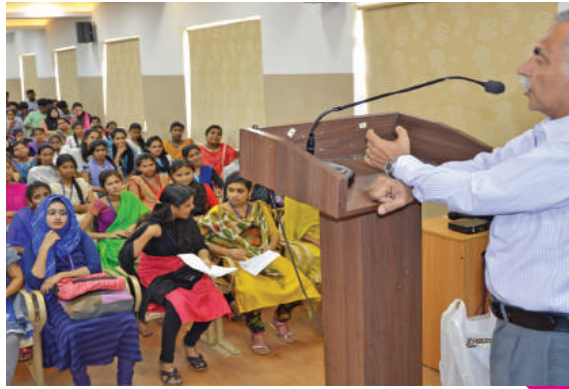
Chief Guest addressing the students at an Awareness programme on HIV AIDS, on December 28, 2017.

Lit the Light 2018 - A Charity Programme was conducted on Feb 6., 2018. Charity is a noble quality in man, brings about welfare to the society. It enlarges the human hearts and spreads the message of brotherhood and innocent love among people. The true meaning of life is the joy of giving . Thus the students were motivated to realize this and engage in charity.