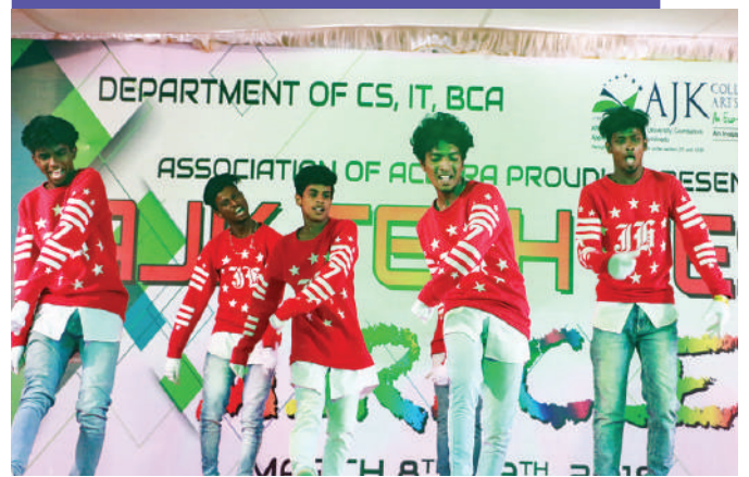
The Students performing a Dance in AJK TECH FEST - Miracle held on March 8, 2018.