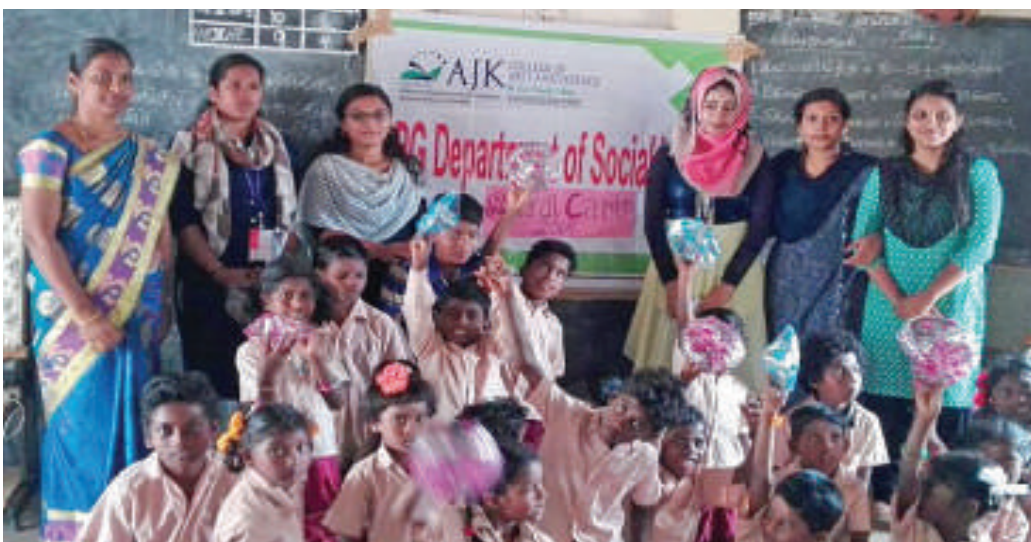
A Curricular Activity Rural Camp 2018- Nibothitha (Being Enlightened) was conducted on Jan 4, 2018, to develop the interest, to train the body and mind to a well balanced personality, to incucate the spirit of working in a team and to help the students develop their sense of social responsibility.