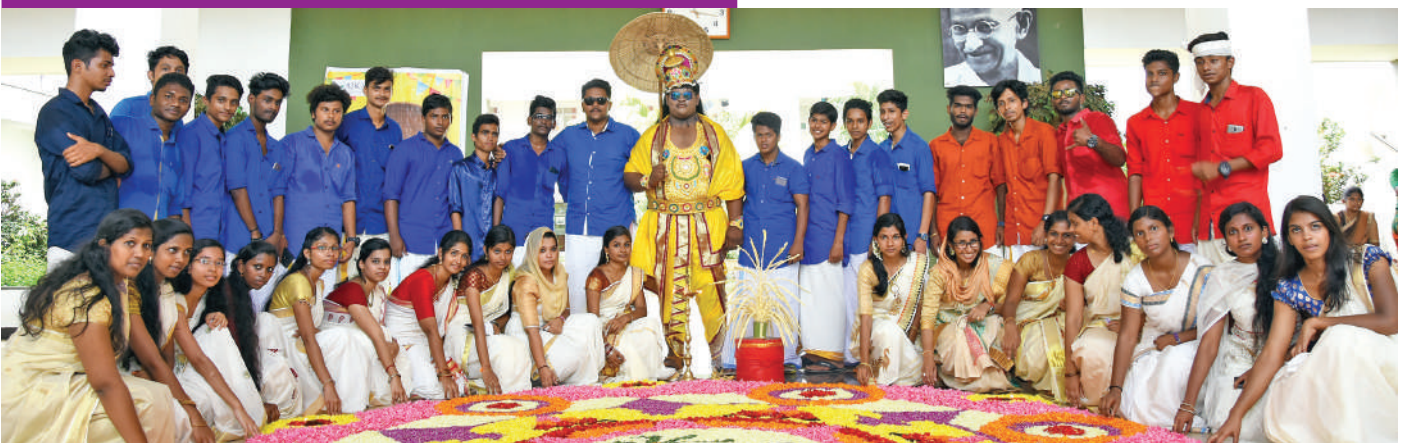
AJK Students Celebrating ONAM in the Traditional Way.