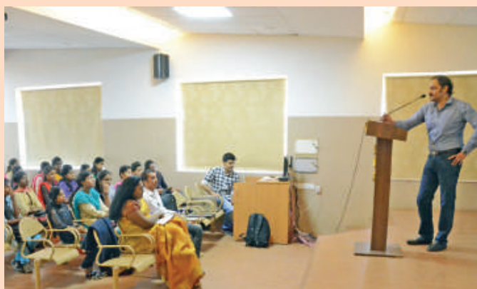
A National level Seminar on Selest

A National-level Seminar on Selest was conducted on Feb 23, 2018, to create an awareness regarding Selenium Software testing framework for webapps. Automation Testing is beneficial and easier way of testing than manual testing.