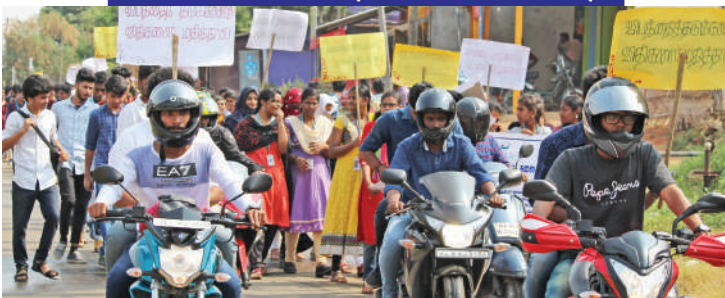
B.Sc. Computer Science Students in the Awareness Rally held on Jan 8, 2018.