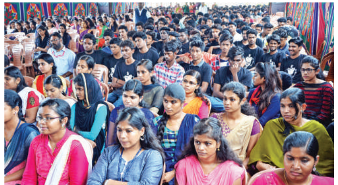
A cross-section of the students of AJKCAS in the College Day and Sports Day Function on March 28th, 2018.