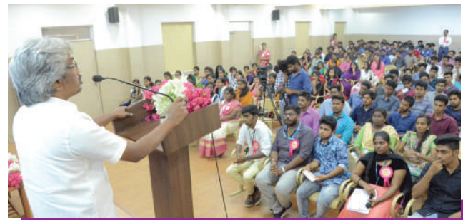
A National Level Seminar on Artificial and Machine Learning was conducted on Feb 20, 2018

A National-level Seminar on Artificial and Machine Learning conducted on Feb 20, 2018, helped the students learn how to connect AI in cloud computing, uses and features.