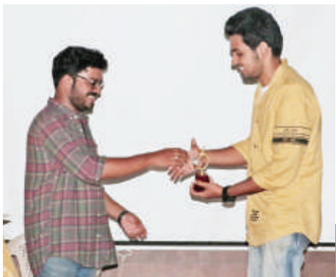
Chief guest gives away Cash Prize of Rs.5000/- to the Best Short film PAGARPPU which has won the 2nd place in the Film Fest.