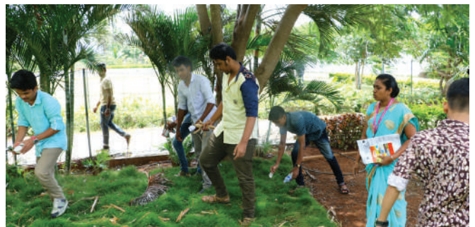
NSS Volunteers cleaned the college campus on 17 AUG 2016