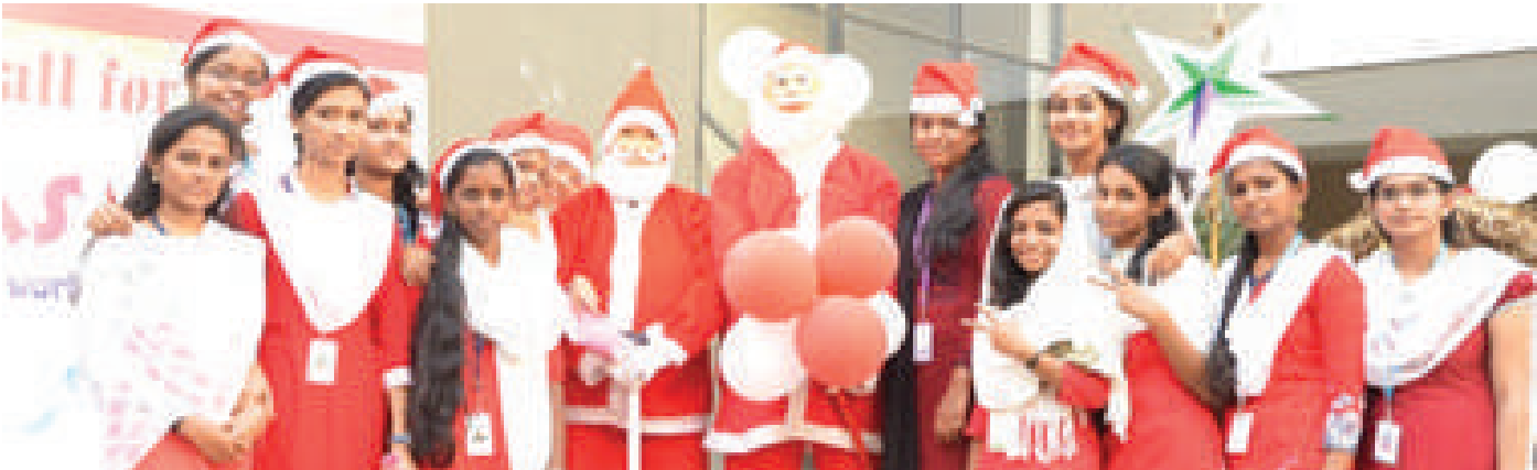
Christmas was celebrated by our students on 22 DEC 2016