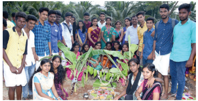
Pongal Celebration was held on 13th Jan 2017 . Students were participated in Various competition in traditional wears.