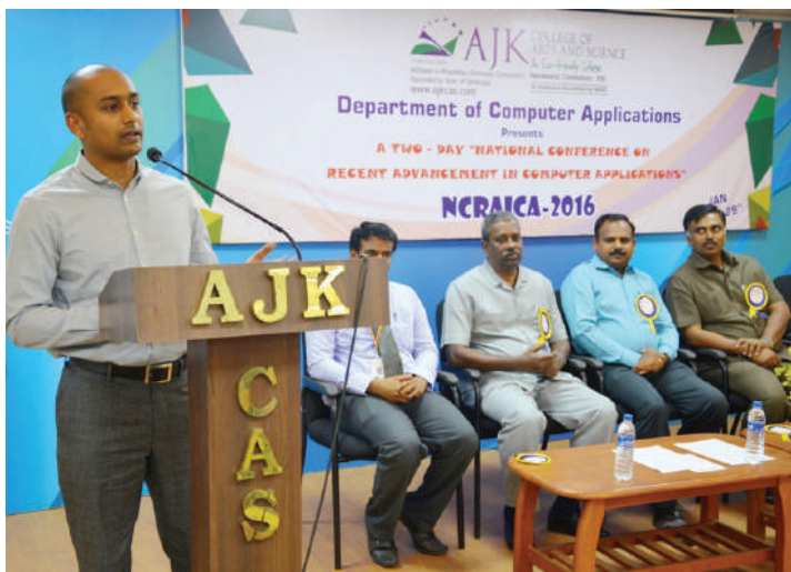
Department of Computer Applications organizes A Two Day National Conference on “Recent Advancements in Computer Application” on 28 & 29th Jun 2016.

A one-day seminar was conducted on the topic “New Trends in web technologies” on 20.01.2017. The resource person presented a clear view about web browsers and web applications. It helped the students learn quite a lot about web technologies.