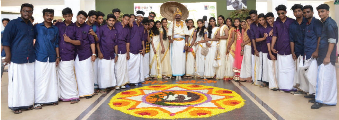
Our Students celebrated the ONAM 2016 on 09.09.2016