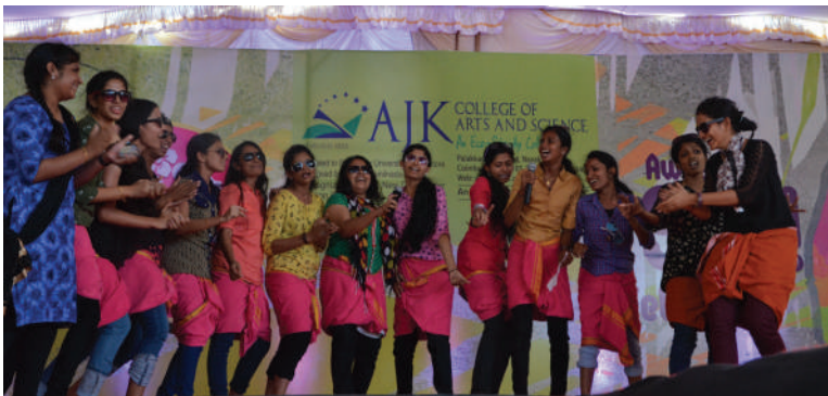
WOMANS DAY was celebrated by our students on 27 FEB 2016