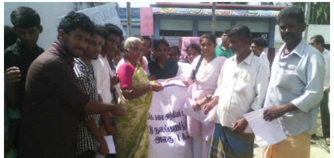
Swatch Bharat Awareness Rally done by NSS Volunteers at Pichanur Village on 19th Aug 2016