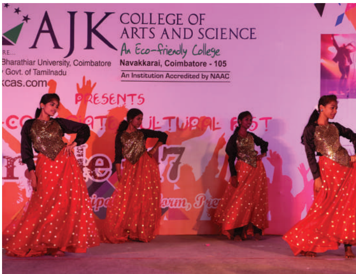
Intercollegiate Cultural Fest “Miracle 2017” was conducted on 16th and 17th Feb 2017