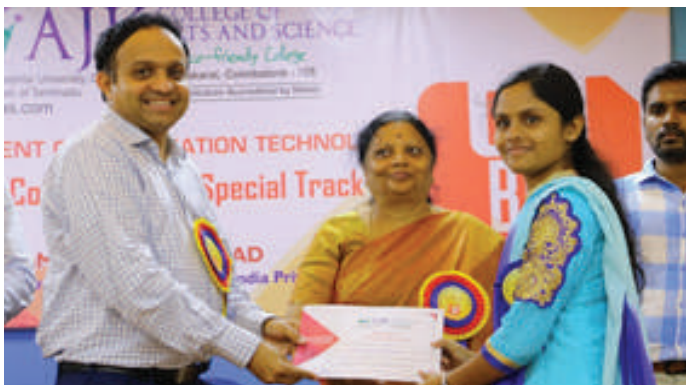
A National Conference was organized on “Special Track in Big Data” on 21.02.2017. The session was about Big Data and types of Big Data.