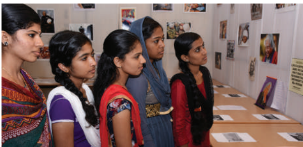
AJKCAS Paid Tribute To Dr.A.P.J. Abdul Kalam, Former President Of India on His First Anniversary and conducted an expo on 27th Jul 2016.