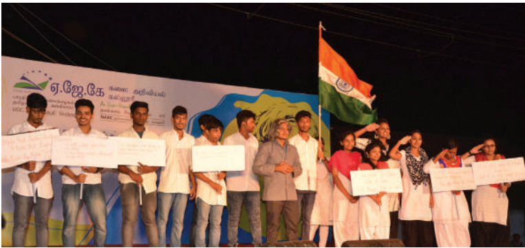
TRIBUTE TO DR. A.P.J. ABDUL KALAM