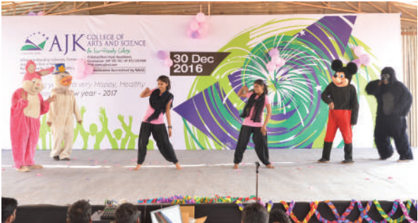
New Year 2017 was celebrated by our students on 30th Dec 2016