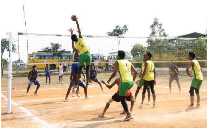
Volley Ball Trophy was conducted for school students on 29th Sep 2016