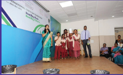
HEALTHY KIDS, HEALTHY FUTURE - 2015 International Chef Day Celebrations was celebrated by the students and faculty members Dept of Hotel Management and Catering Science AJKCAS on 20th October 2015 on the theme HEALTHY KIDS, HEALTHY FUTURE