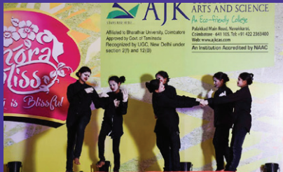
SENIORITA BLISS-2016 Senorita Bliss-2016, Awesome She!, AJK Institution Campus On Feb 27th 2016

The students of Department BBA - CA AJKCAS have attended a One day, "Out Bound Leadership Training Program" in Coimbatore on 6thth Jan 2016